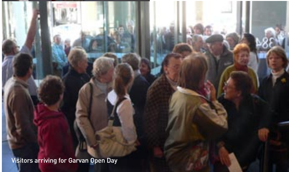
Visitors arriving for Garvan Open Day

Garvan intends to have another Open Day in 2010. In the meantime, if you would like an opportunity to go on a tour of the Garvan, tours run from 10am on the 1st and 3rd Thursday of each month. Bookings are essential, for more information please call 9295 8108.