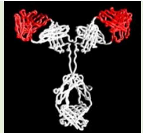
Antibody molecule (with variable regions shown in red)

For example, rituximab (the first antibody approved to treat cancer) binds to the CD20 molecule on B cells and is now in routine use for the treatment of lymphomas arising from these particular white blood cells. Herceptin (used to treat some breast cancers) binds to HER2, a receptor for epidermal growth factor (EGF) found on some tumour cells in breast cancer and lymphomas.