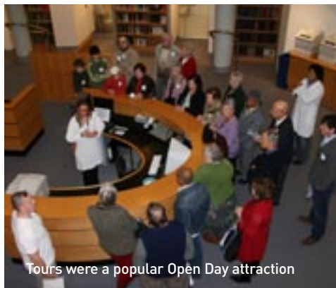
Tours were a popular Open Day attraction

The overwhelming response to Garvan Open Day left many staff and volunteers wondering if the Boxing Day sales had arrived. Visitors lined Victoria St outside the Garvan in anticipation of the doors opening. By the end of the day nearly 1000 visitors had come through our doors.