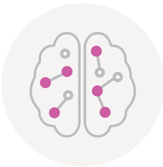
Image: Dopaminergic neuron