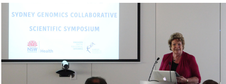
The Hon. Jillian Skinner, NSW Minister for Health, launching the inaugural Sydney Genomics Collaborative Scientific Symposium on 7 December.

The day included updates from the 2014/15 NSW Genomic Collaborative grants awardees seeking to better understand treatment response in melanoma and the genetic basis of schizophrenia, mitochondrial disease, and congenital heart disease in babies.